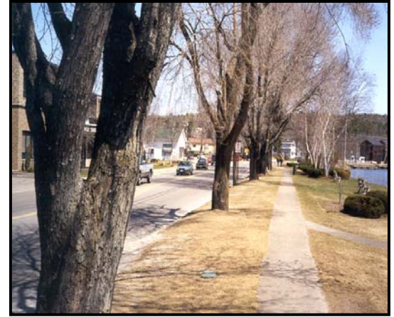
NH Route 25, Meredith, NH

By conducting a Smart Growth Audit, many communities are able to identify areas where their ordinances and regulations may be in conflict with their Master Plan Goals.